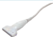
L8 Linear Probe